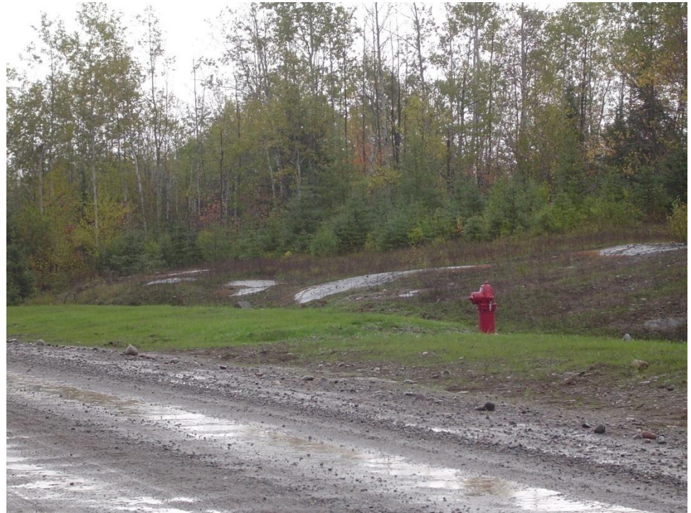
Fall of 2008 waterline on Corral Road

MEDC Grant of $600,000 for waterline extension and Rural Development $200,000 Loan Fund into an Industrial Development District