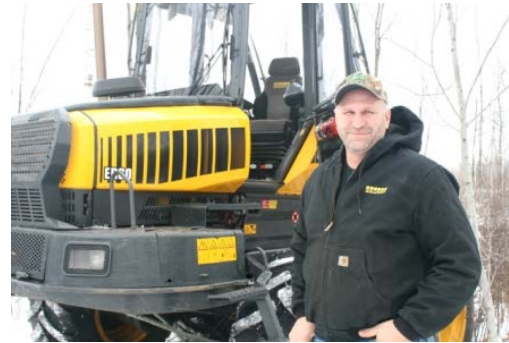
Enterprise Forest Products